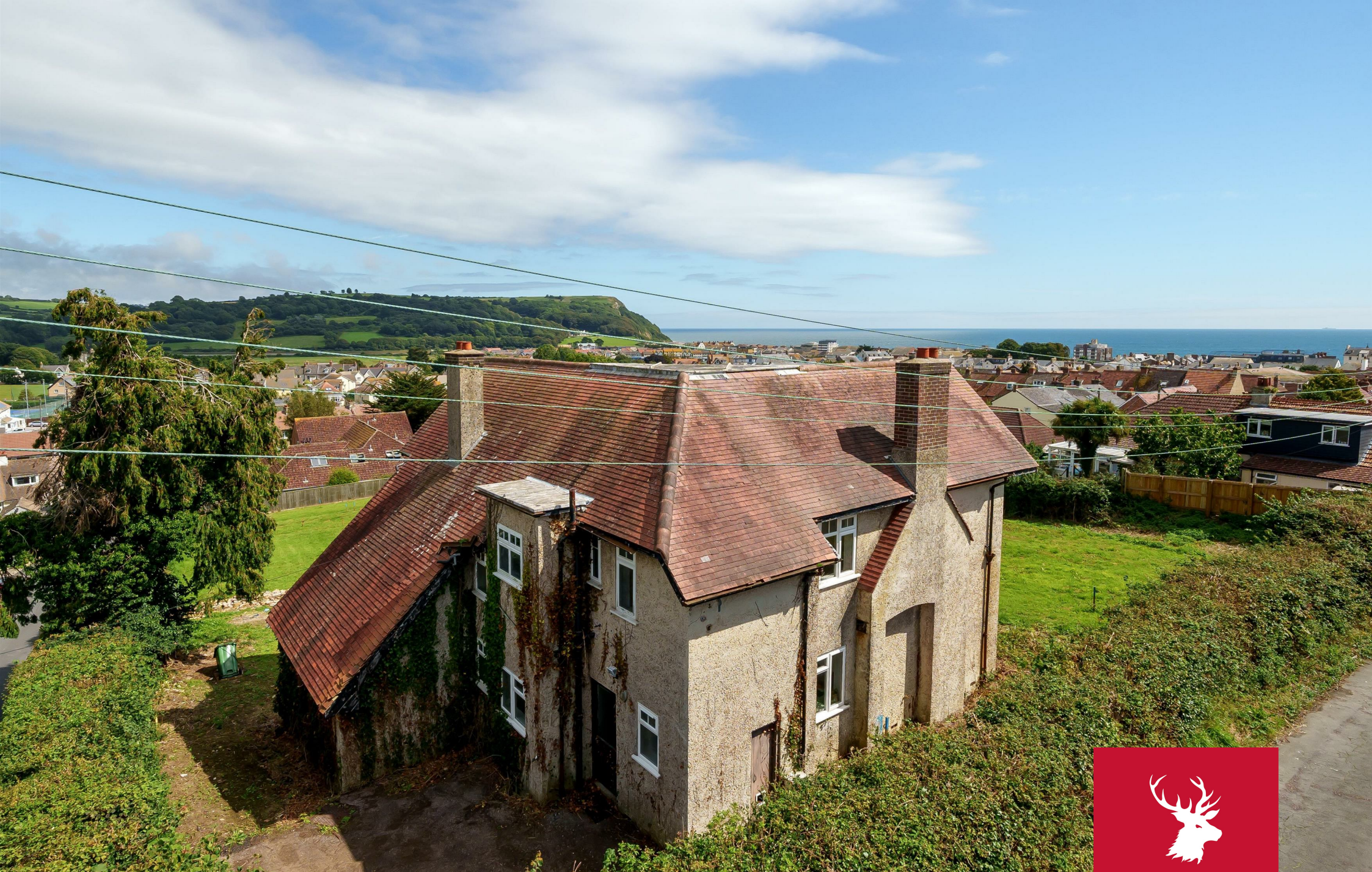
House and Plot at 15 Townsend Road